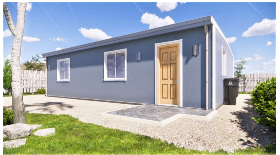
OPTION 2 GABLE ROOF