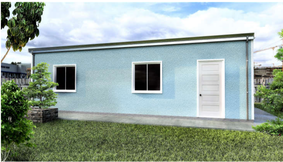
OPTION 1 SKILLION ROOF