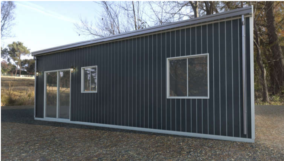
OPTION 1 SKILLION ROOF