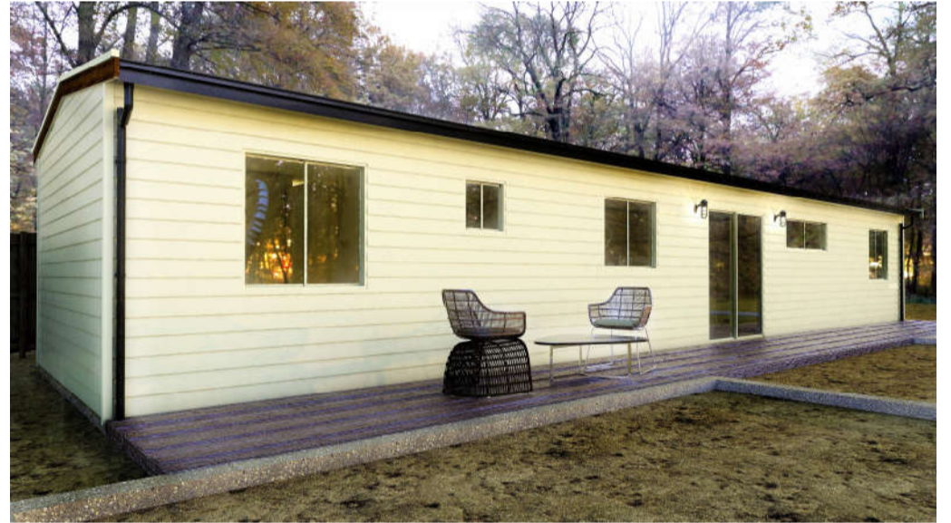
OPTION 2 GABLE ROOF