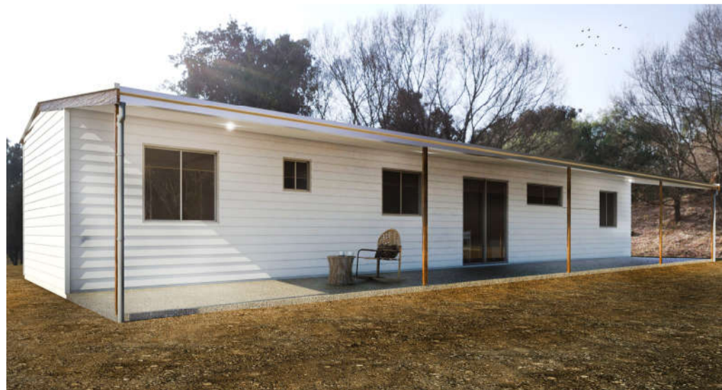
OPTION 3 GABLE ROOF WITH VERANDAH