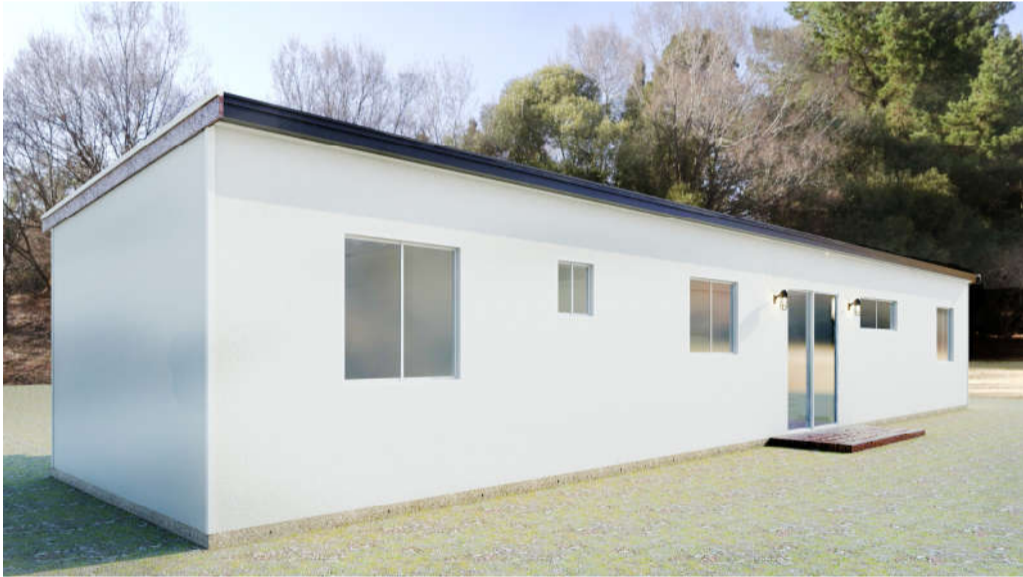
OPTION 1 SKILLION ROOF