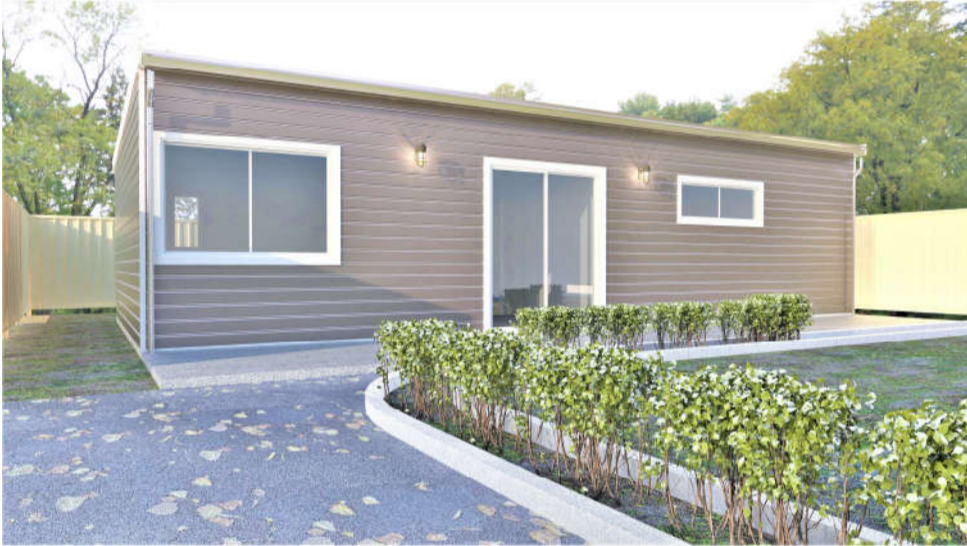
OPTION 1 SKILLION ROOF