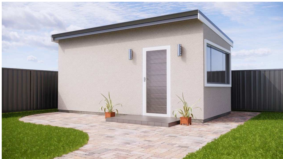
OPTION 1 SKILLION ROOF