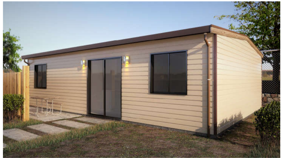
OPTION 2 GABLE ROOF