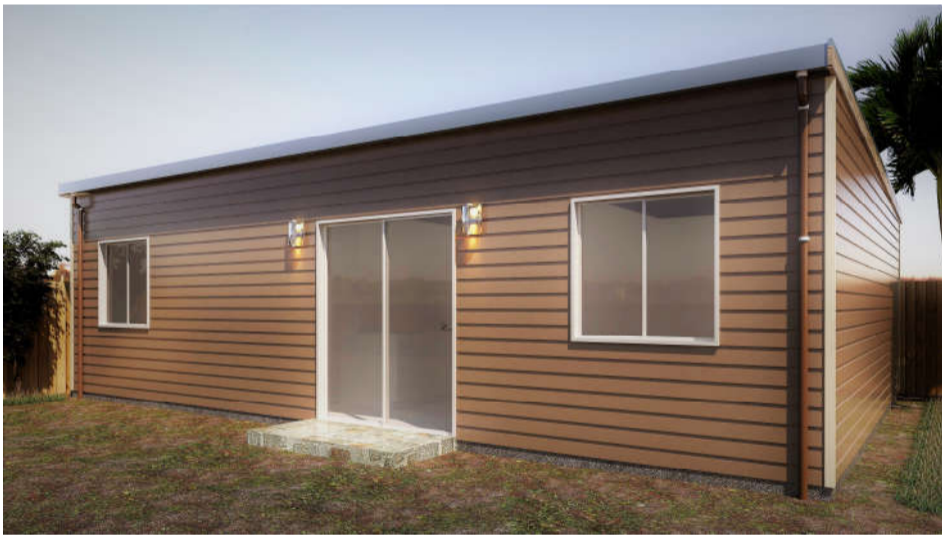
OPTION 1 SKILLION ROOF