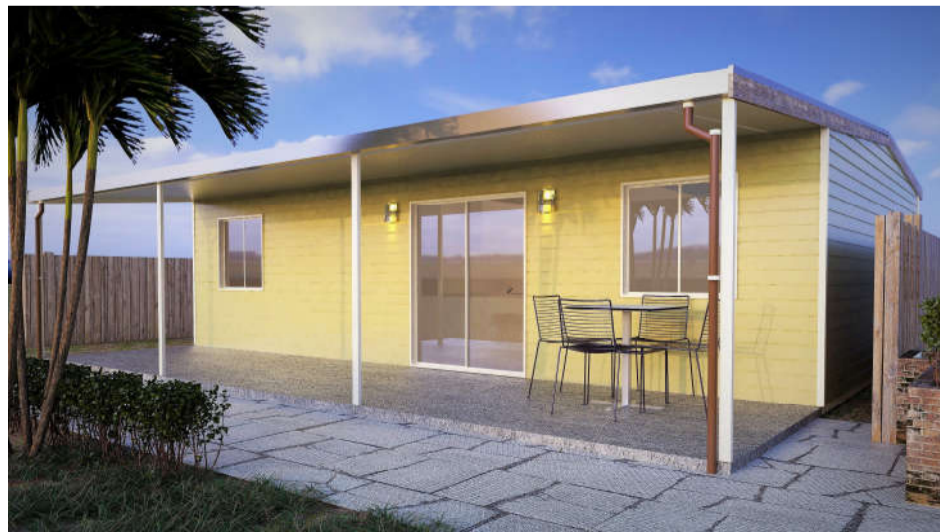
OPTION 3 GABLE ROOF WITH VERANDAH