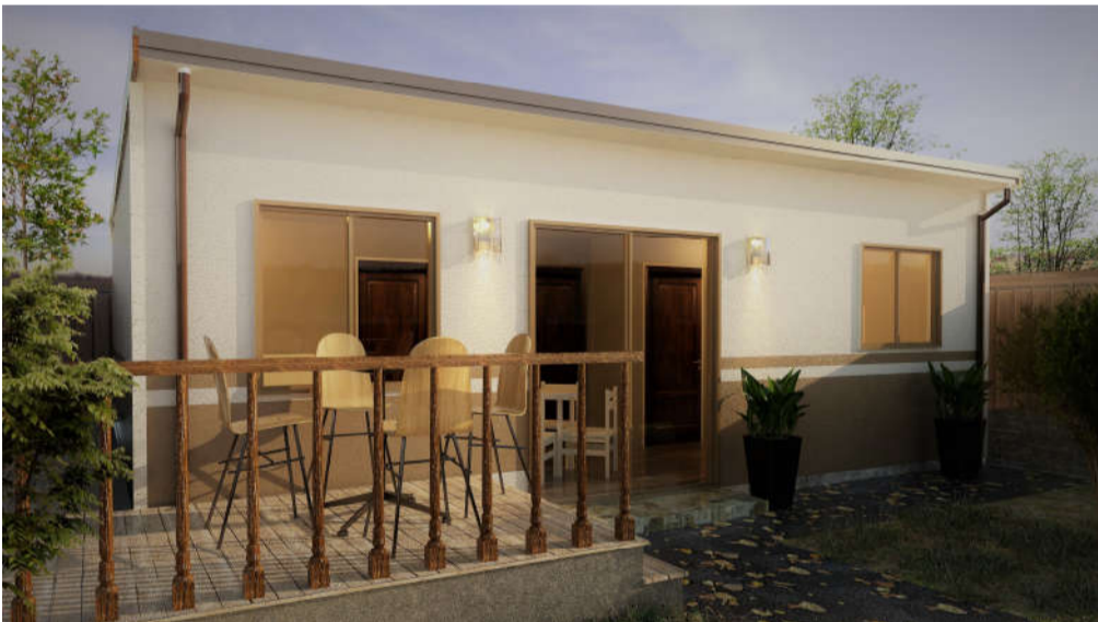
OPTION 1 SKILLION ROOF