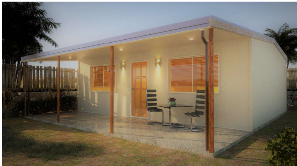
OPTION 3 GABLE ROOF WITH VERANDAH