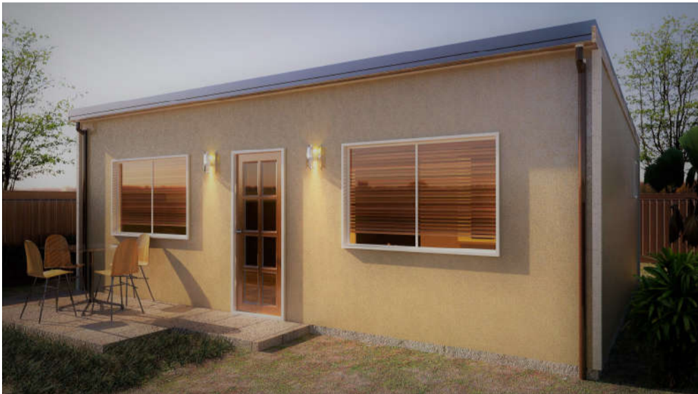
OPTION 1 SKILLION ROOF