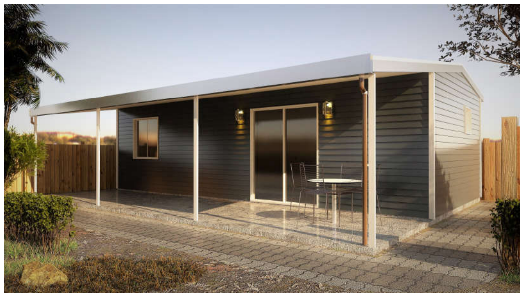
OPTION 3 GABLE ROOF WITH VERANDAH