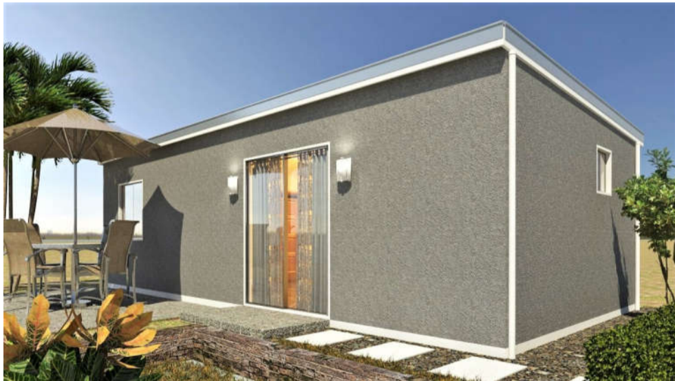
OPTION 1 SKILLION ROOF