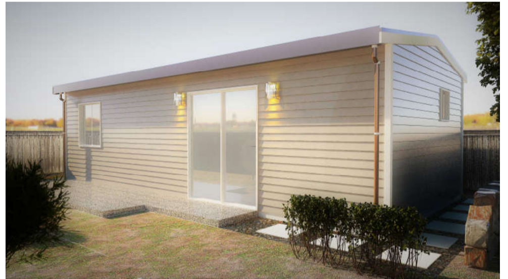
OPTION 2 GABLE ROOF