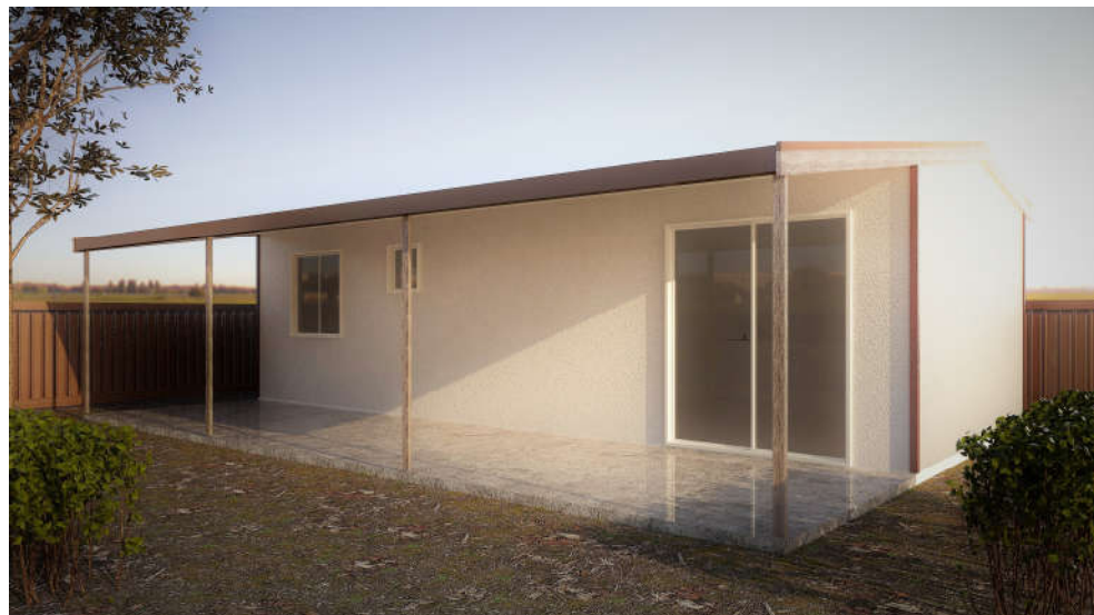
OPTION 3 GABLE ROOF WITH VERANDAH