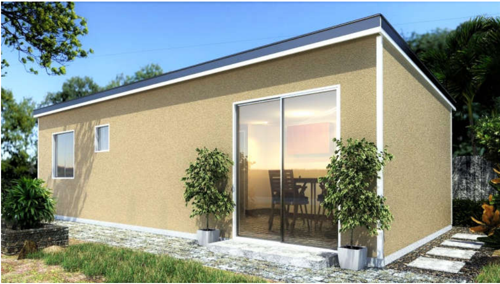
OPTION 1 SKILLION ROOF