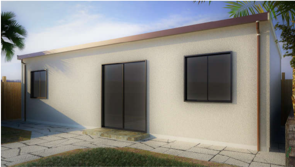
OPTION 1 SKILLION ROOF