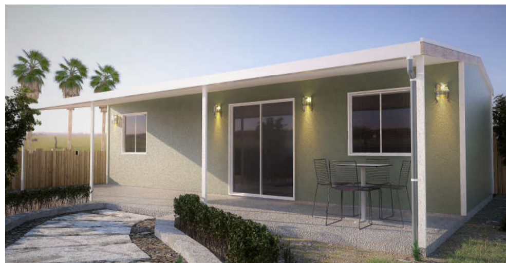
OPTION 3 GABLE ROOF WITH VERANDAH