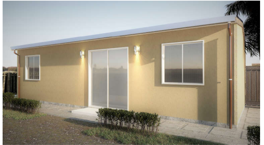
OPTION 2 GABLE ROOF