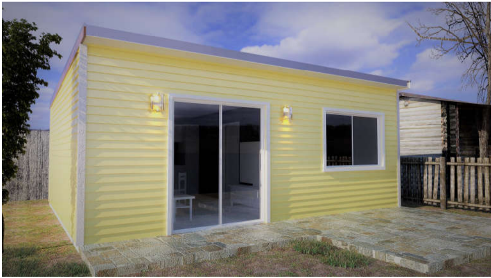
OPTION 1 SKILLION ROOF