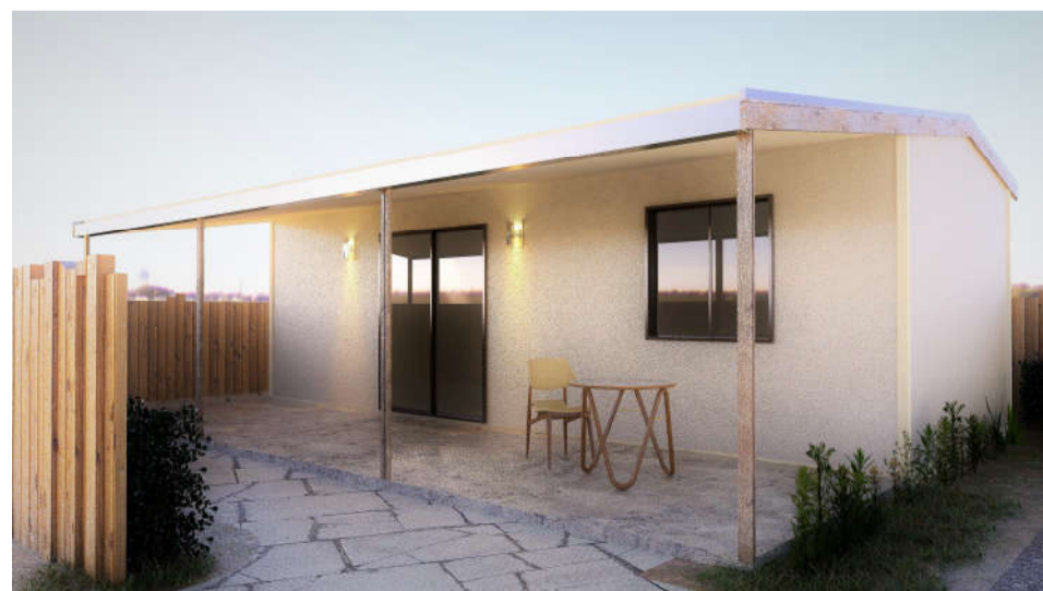
OPTION 3 GABLE ROOF WITH VERANDAH