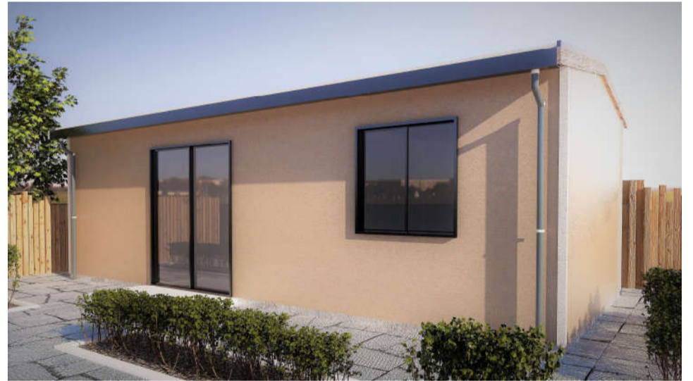
OPTION 2 GABLE ROOF