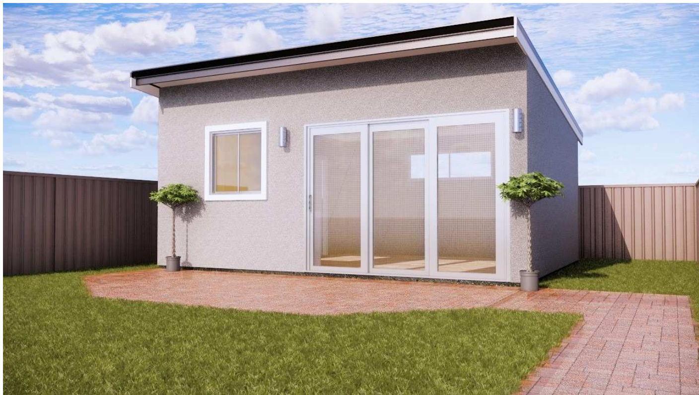
OPTION 1 SKILLION ROOF