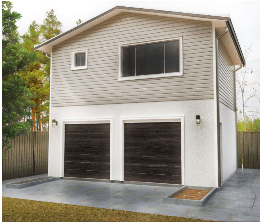
BANKSIA - 84m 2