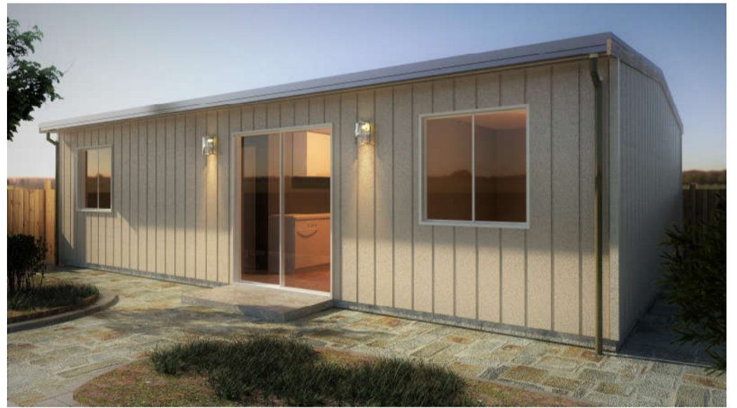
OPTION 2 GABLE ROOF