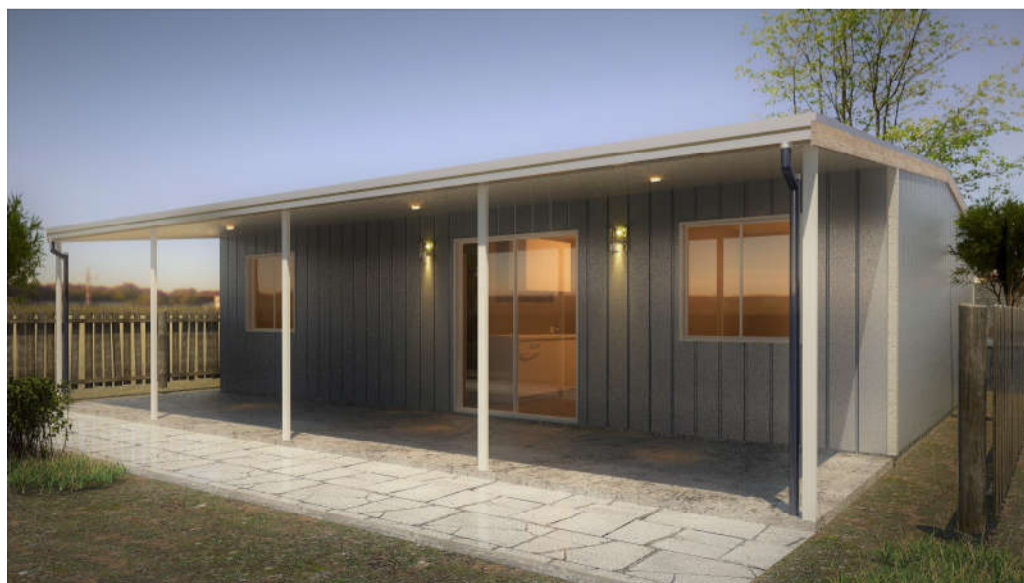
OPTION 3 GABLE ROOF WITH VERANDAH