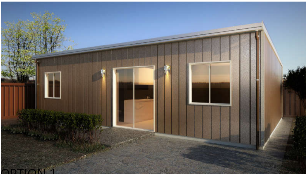
OPTION 1 SKILLION ROOF