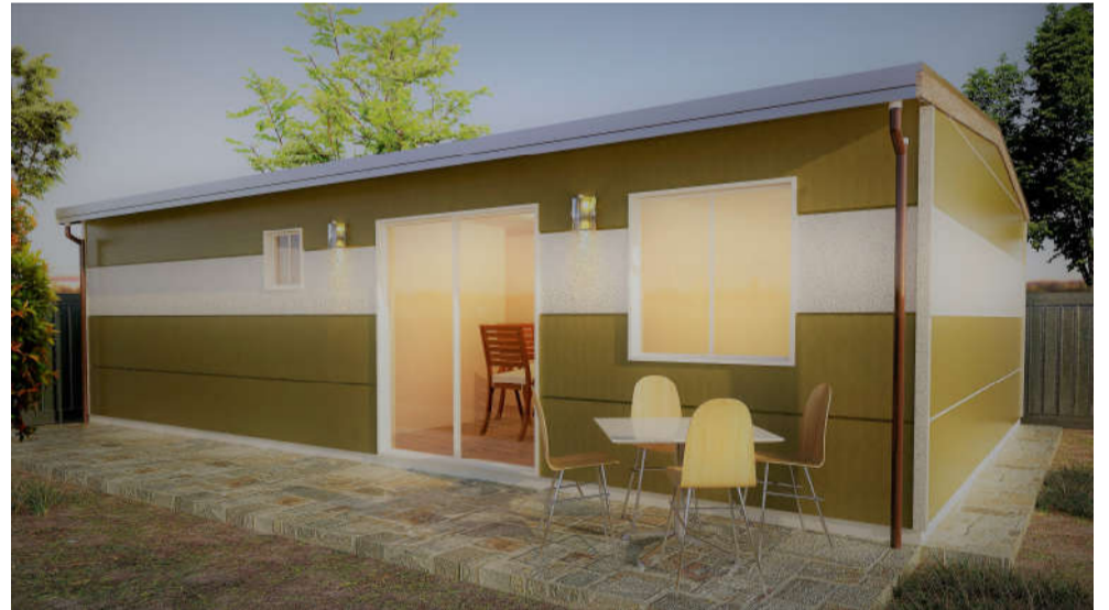
OPTION 2 GABLE ROOF