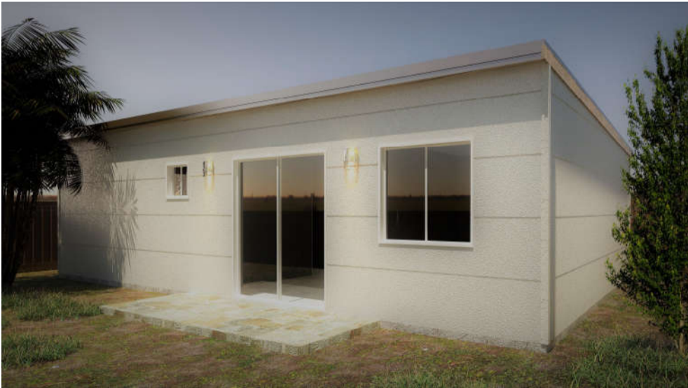
OPTION 1 SKILLION ROOF