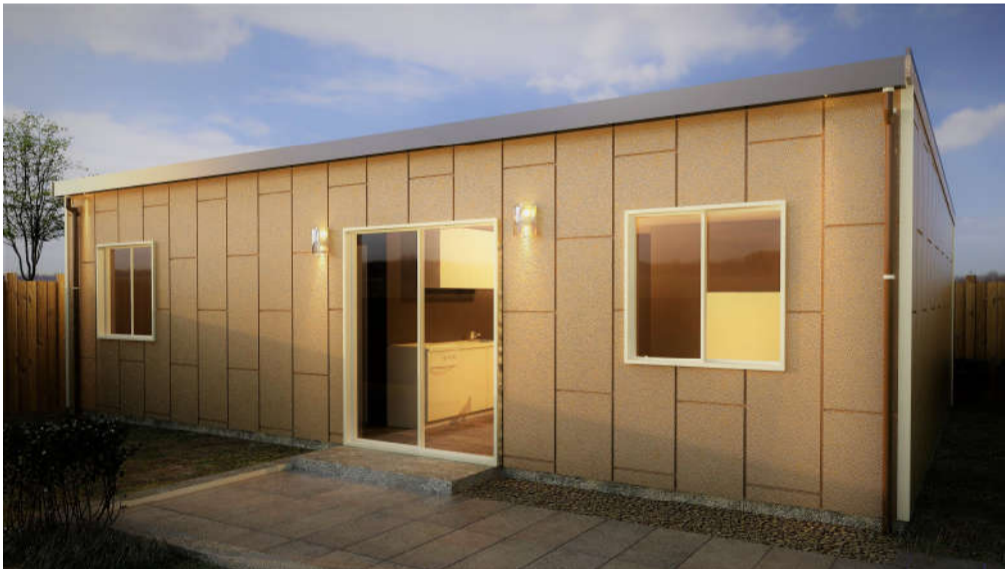
OPTION 1 SKILLION ROOF