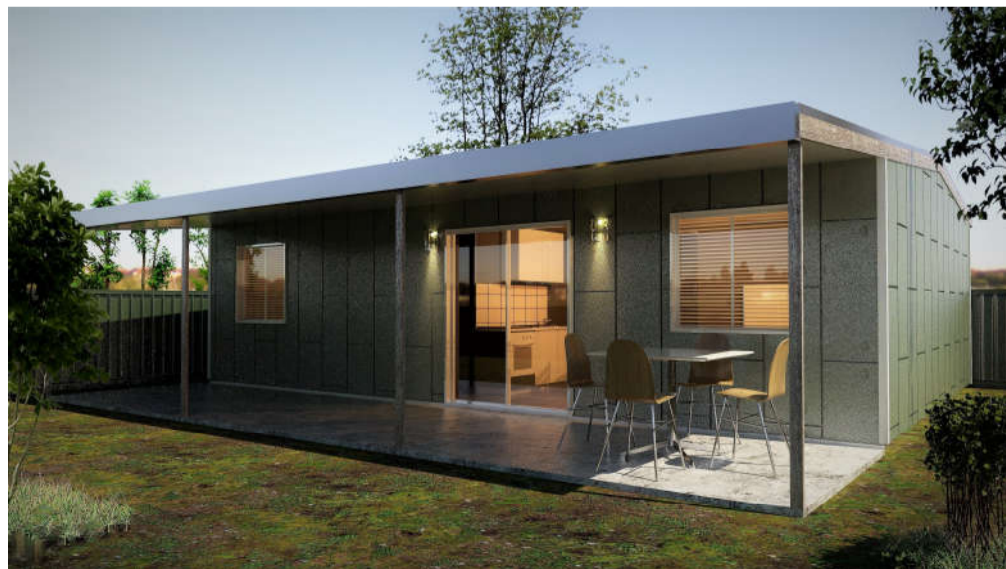
OPTION 3 GABLE ROOF WITH VERANDAH