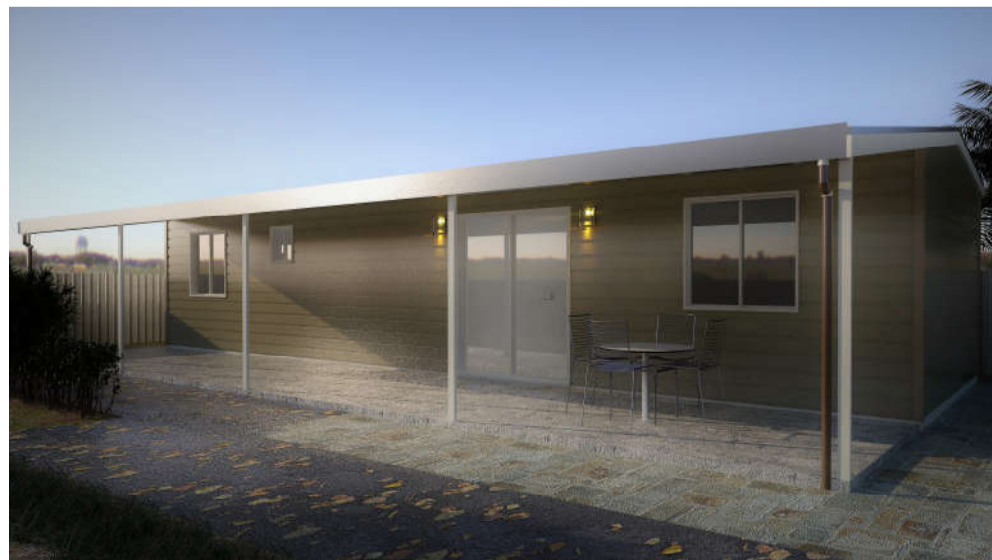
OPTION 3 GABLE ROOF WITH VERANDAH