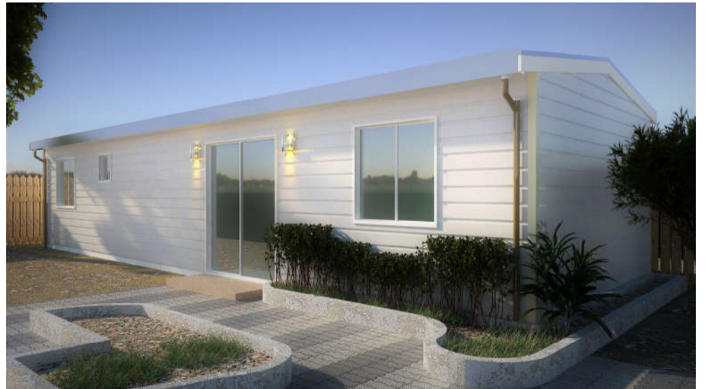
OPTION 2 GABLE ROOF