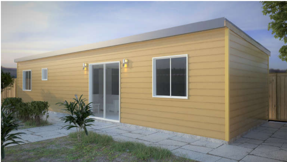
OPTION 1 SKILLION ROOF