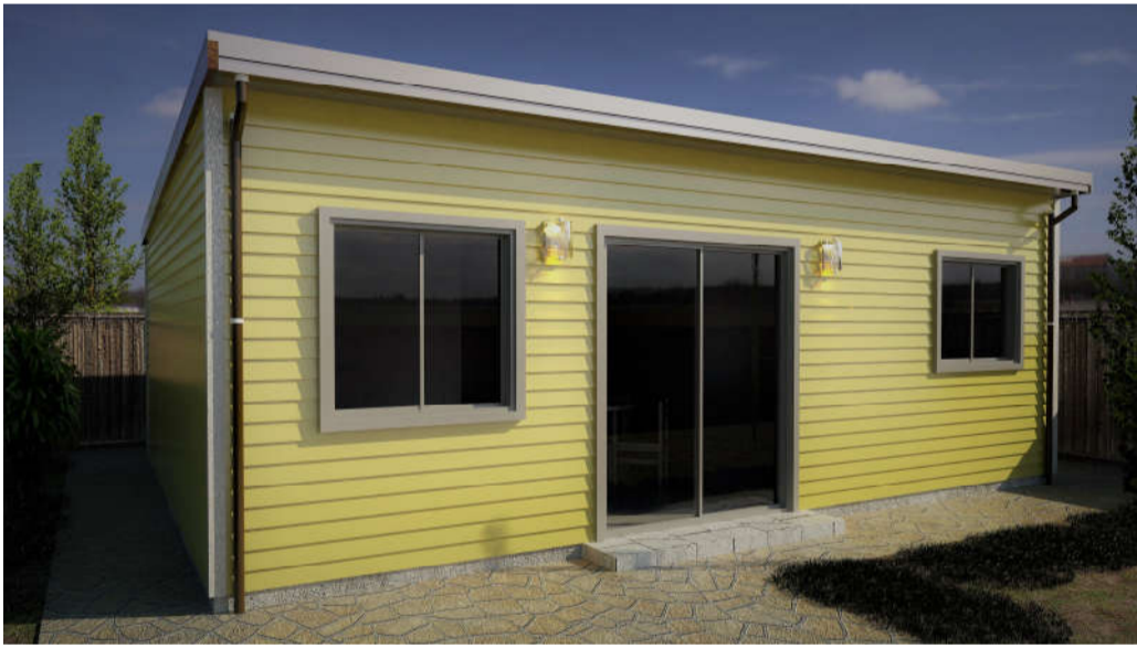
OPTION 1 SKILLION ROOF