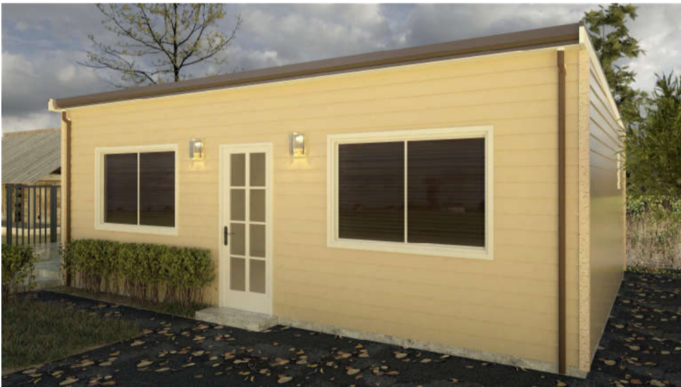
OPTION 1 SKILLION ROOF