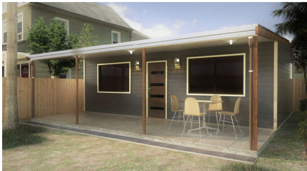
OPTION 3 GABLE ROOF WITH VERANDAH