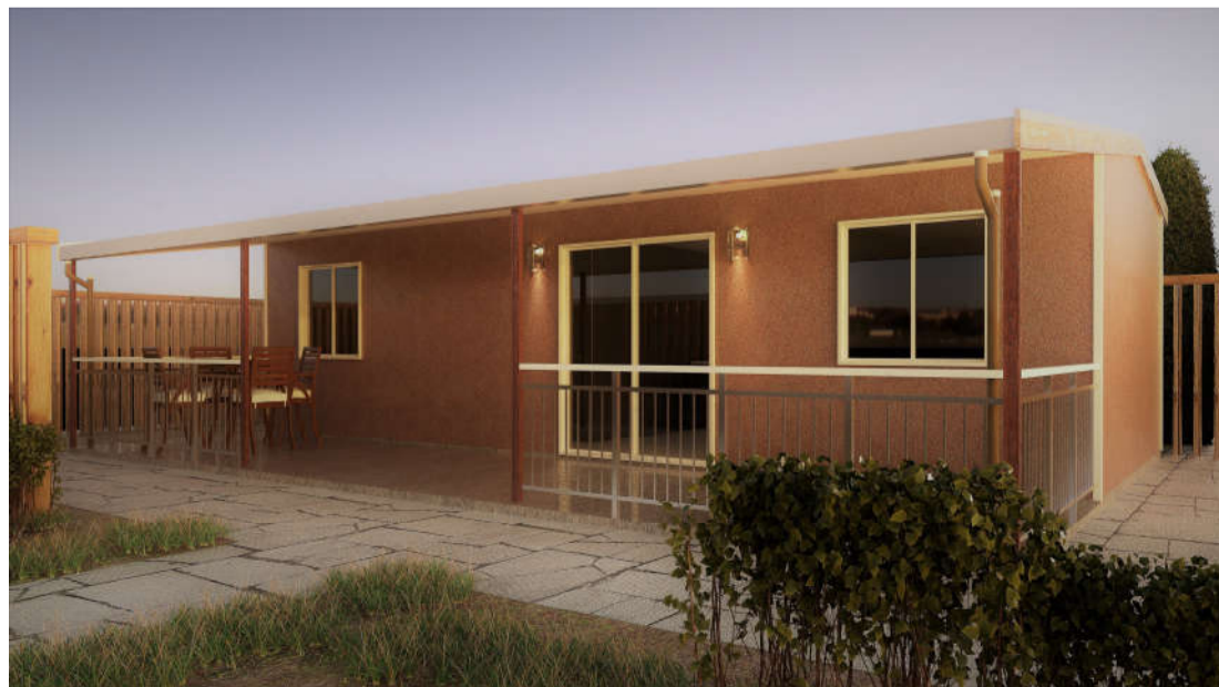
OPTION 3 GABLE ROOF WITH VERANDAH