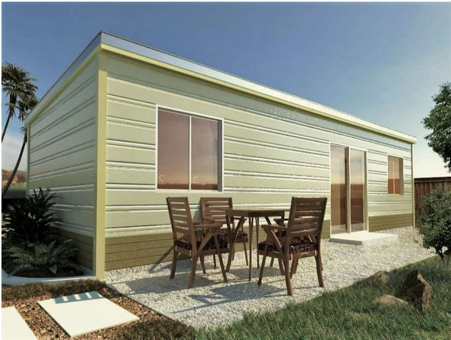
OPTION 1 SKILLION ROOF