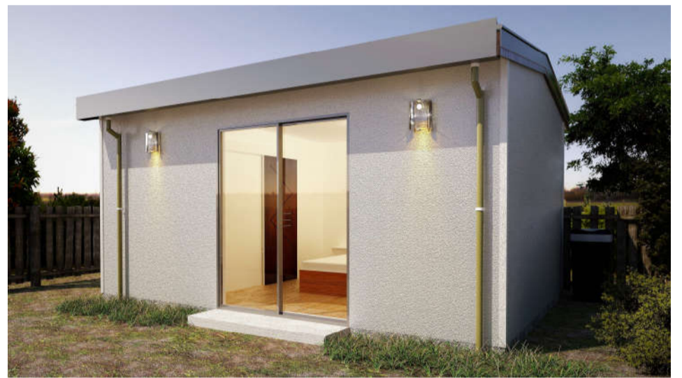
OPTION 2 GABLE ROOF