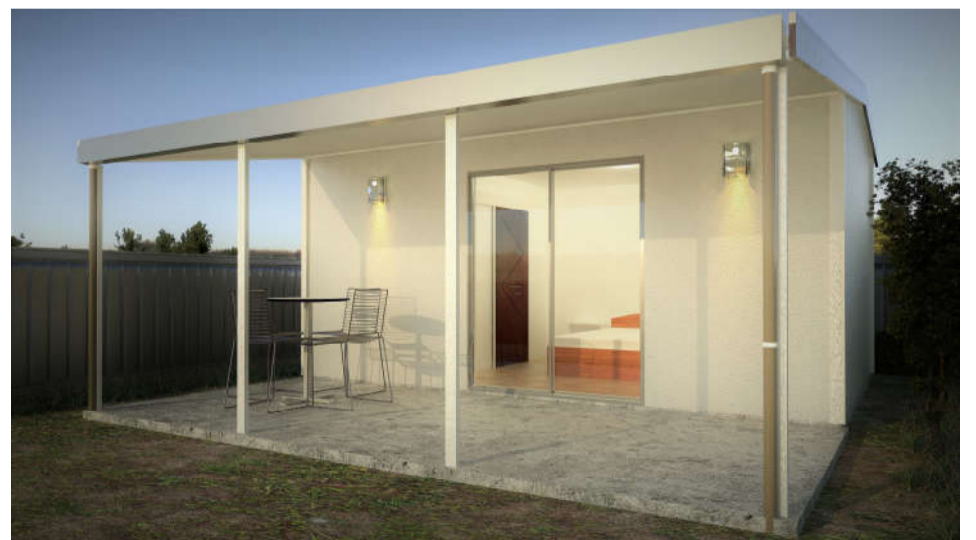
OPTION 3 GABLE ROOF WITH VERANDAH